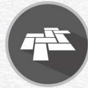
INTERNAL PAVED AREA