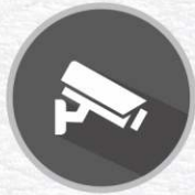
C.C. TV CAMERA