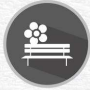
SENIOR CITIZEN SITTINGS