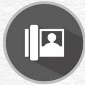
VIDEO DOOR SYSTEM